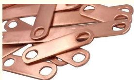
Suitable for DIY battery connector and ground busbar, heat exchange device, etc.