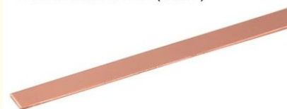
Material: C110 pure copper

Length: 400mm (15.7") Width: 30mm (1.2") Thickness: 0.5mm (0.02")